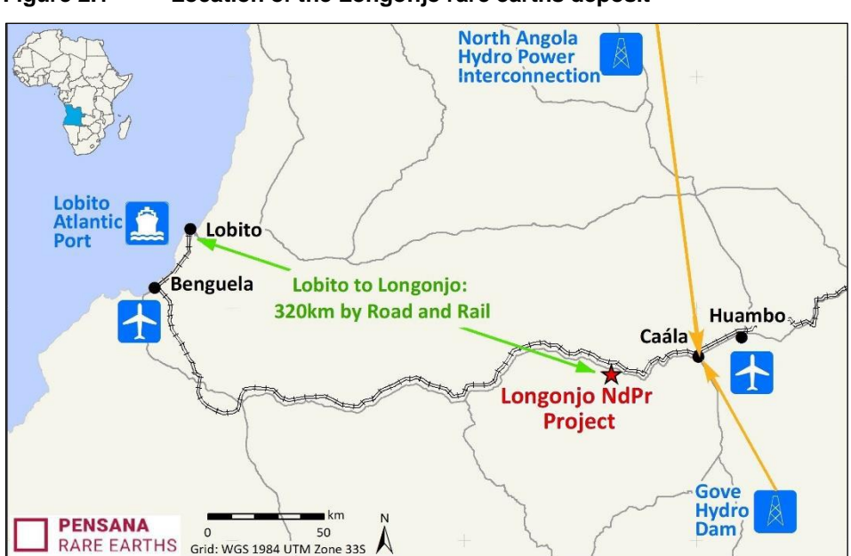
Figure 2.1 Location of the Longonjo rare earths deposit

The Longonjo rare earths deposit is located within the Longonjo municipality of Huambo Province, approximately 60 km west of the provincial capital of Huambo in central Angola. Access to the project is from both sealed national road (EN110) and Benguela railway line (Caminho de Ferro de Benguela) and both pass within approximately 5 km of the project area.